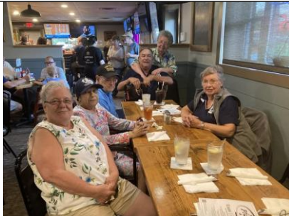
May 19 Trivia Night at My Place Restaurant in Schodack with Alumni