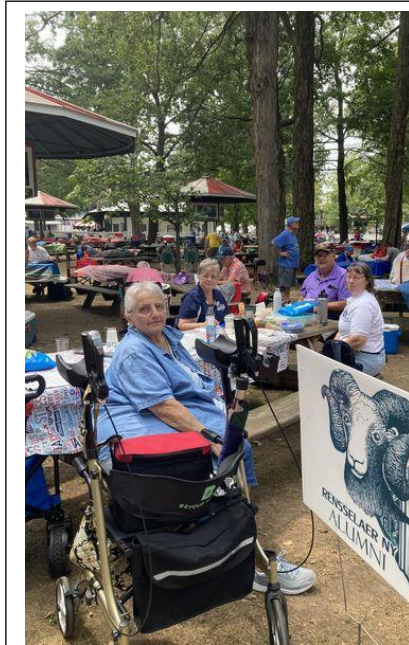
August 2 Alumni members enjoyed a day at the Saratoga Race Track.